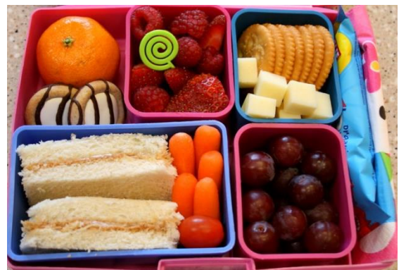
An American "bento box"

In addition to sandwiches, we pack foods rich in nutrients such as whole bananas, apples, and oranges, berries like strawberries and blueberries, vegetables like cherry tomatoes and cut raw veggie sticks, and dairy like string cheese and yogurt. Sometimes we pack salty snacks such as potato chips or pretzels, or sweet desserts such as pudding or cookies.