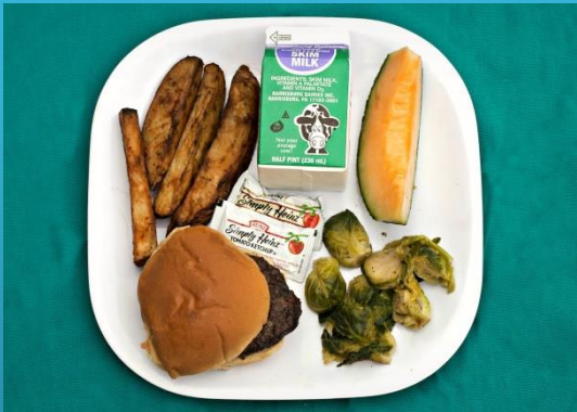
The United States