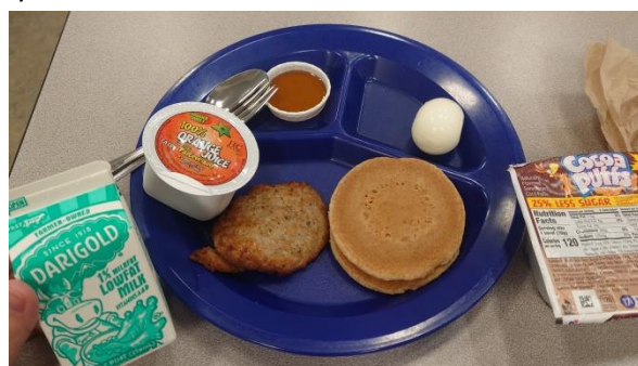
Pancakes, sausage patty, hard-boiled egg, cereal, orange juice, and low-fat milk

In addition to school lunch, American schools also offer school breakfast. Students can eat breakfast staples such as cereal, bread, fruit, yogurt, sausage, and hard-boiled eggs. In America, there is a large income gap, and there are many students who cannot eat three proper meals a day at home. Being able to eat two nutritious meals at school for free is a saving grace for families struggling with poverty. My family was poor, so I always ate breakfast and lunch at school.