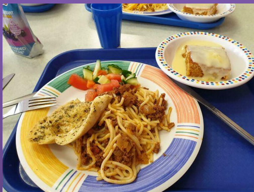
The United Kingdom