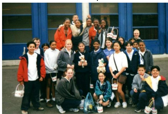
My class in middle school. There were only two blond-haired, blue-eyed kids.

There are areas in America with few white people. My hometown, Seattle, was about 70% white, but my particular ZIP code area was one of the most diverse areas in the United States. The percentage of Black, white, and Asian American residents was about equal. Actually, the white population of the United States is decreasing, and is projected to fall under 50% by 2045.