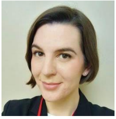
By Krystal Sato