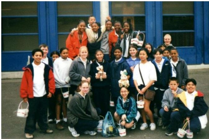
My middle school classmates. We were a diverse group.

By the way, many Americans don't even know this, but "Hispanic" is not a race. "Hispanic" means that person has roots in a Spanish-speaking country, so white people, black people, and people of other races can be Hispanic American.