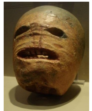
(A traditional Irish jack-o'-lantern replica, made from a turnip ↑)

would open, so dead relatives would return home. They also believed that fairies and ghosts would roam the earth. In order to keep evil spirits at bay, the Gaels carved lanterns from turnips and potatoes and displayed them outside their homes. When Irish and Scottish people started immigrating to America in the 19 th century, they brought their vegetable lantern carving tradition with them. Pumpkins, which are native to North America, proved to be easier to carve than turnips and potatoes, so the modern jack-o'-lantern was born.