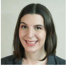
By Krystal Sato