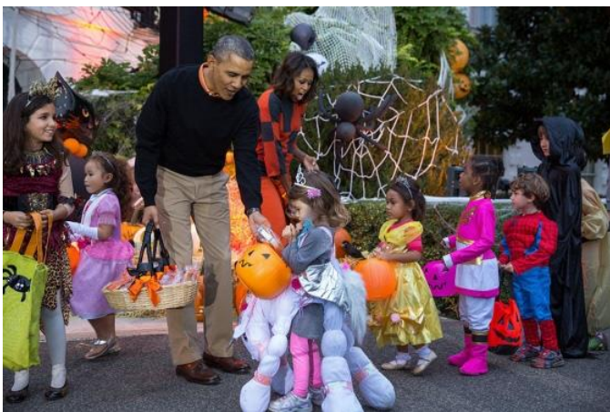
(The Obamas handing out Halloween candy to trick-or-treaters at the White House. I wonder what kind of candy they have. Maybe full-sized candy bars?)

Trick-or-treating is American children's most loved Halloween event. First of all, you need a costume. Vampires, witches, ghosts, and other scary costumes are standard, but cute character costumes are also extremely popular. I can remember the first time I went trick-or-treating, I went as a ballerina, and my brother went as a pirate. Once it gets dark, trick-or-treating begins. We go to a house with a porch light on, ring the doorbell, and shout "TRICK OR TREAT!" at whoever opens the door. Then, they give us some candy.