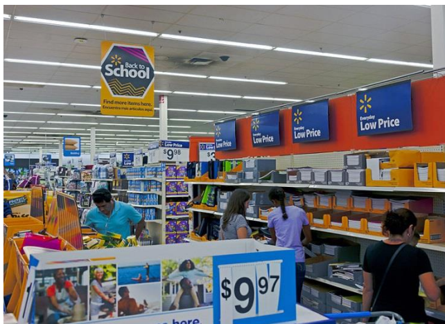
(Back to School Sale)

families take advantage of "Back to School" sales in order to purchase school supplies and clothes for the new school year. Recently many school districts are lacking funds to provide basic supplies. Some schools are so strapped for cash that teachers ask parents to buy communal supplies and materials for the whole class to use.