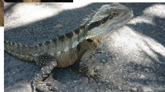
(Australian animals: ↑Possum ↓Frillneck Lizard)