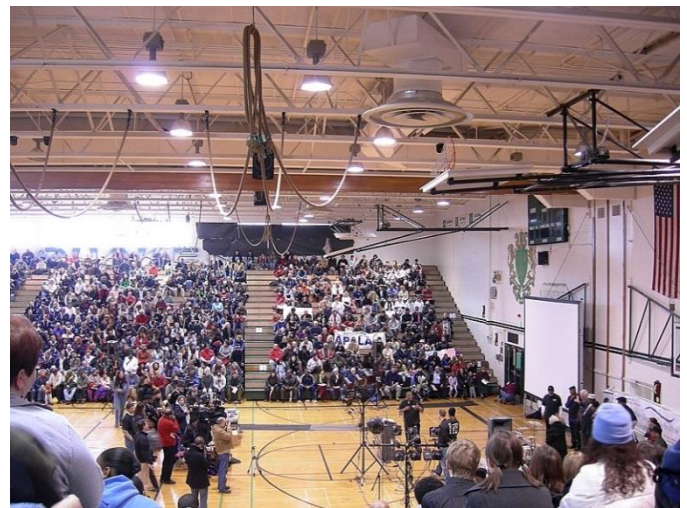
(My high school's Martin Luther King Day Assembly)

In Japan, there are entrance ceremonies when one enters elementary, junior high, or high school. However, in America there are no ceremonies, and students go straight to class on the first day of school. Also, students don't start school from the 1 st grade, but from one year earlier, which is called kindergarten. Generally, elementary school is kindergarten to 5 th