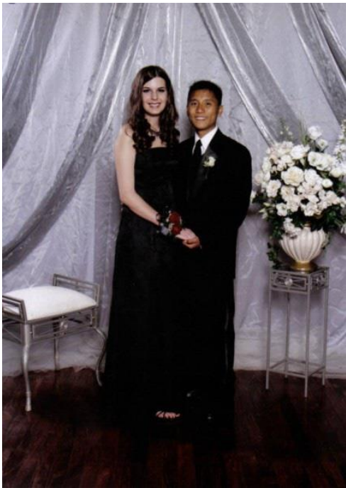
(My Senior Prom. The boy was just a friend.)

grade, middle school is 6 th grade to 8 th grade (equivalent to elementary 6 th grade to junior high 2 nd grade in Japan), and high school is 9 th grade to 12 th grade (equivalent to junior high 3 rd grade to high school 3 rd grade in Japan). American students spend 13 years in school total. There are special names for the high school grades: freshman, sophomore, junior, and senior. University years use these names as well.